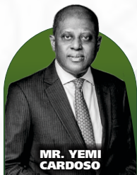
MR. YEMI CARDOSO