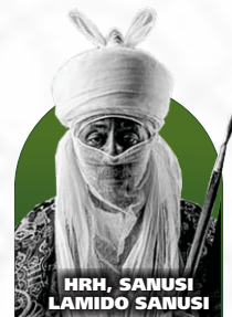
HRH, SANUSI LAMIDO SANUSI